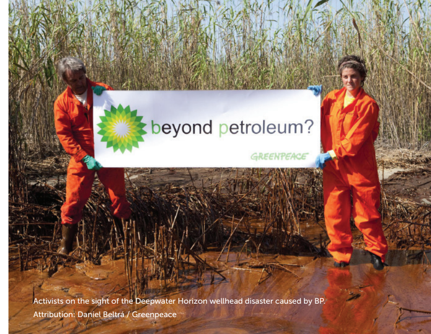
Activists on the sight of the Deepwater Horizon wellhead disaster caused by BP.