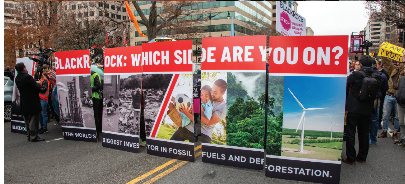
Activists in Washington, D.C. refuse to take BlackRock’s promises at face value.