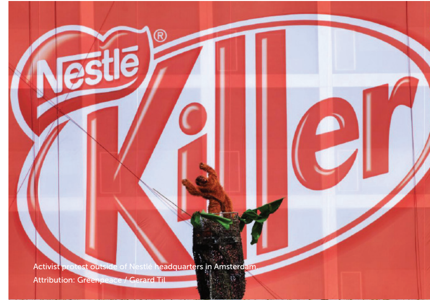
Activist protest outside of Nestlé headquarters in Amsterdam

For example, United Airlines is counting on building carbon direct air capture plants to be able to use Direct Air Capture (DAC) technology that doesn’t exist yet to literally hope to suck carbon out of the air and pump it into the ground (a process, by the way, that is intended to be used for Enhanced Oil Recovery to extract even more oil in hard-to-reach places). Walmart’s climate plan entirely overlooks Scope three emissions (meaning the emissions associated with the products it sells), a type of emissions that counts for an estimated 95 percent of its carbon footprint. Fossil gas will continue to represent 90 percent of oil major Eni’s production and it is still planning to increase oil and gas production over the coming years, a feat that the corporation proposes will be compensated for through reforestation schemes that have been criticised as fake forests. 92 93 BlackRock , the world’s largest asset manager, has pledged to reach “net zero” emissions in its portfolio by 2050. But despite pledging in 2020 to sell off most of its fossil fuel shares “in the near future”, it still owns US$85 billion in coal assets due to a “loophole” in its policy. The list of failings goes on and on and on.